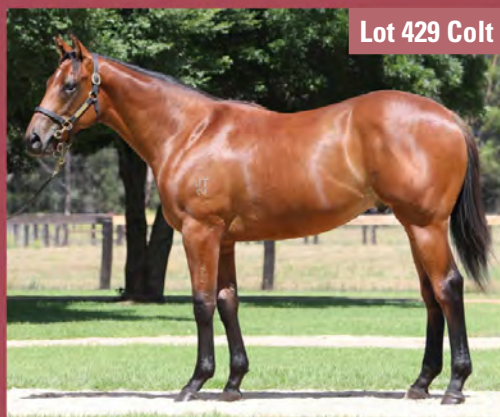
Lot 429 Colt