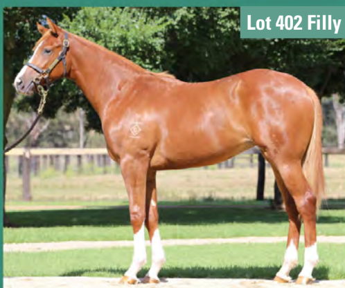
Lot 402 Filly