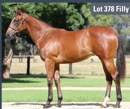
Lot 378 Filly

Third foal of a daughter of champion sire Fastnet Rock from the family of champion racehorse Mahogany, 19 wins and $3.6 million, eight at Group I level.