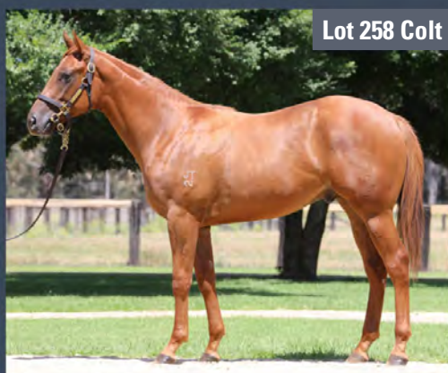
Lot 258 Colt

First foal of 11 time winning half-sister to Group I winner Harry's Son, Champion 2YO Colt South Africa 2013/2014.