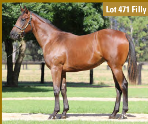
Lot 471 Filly