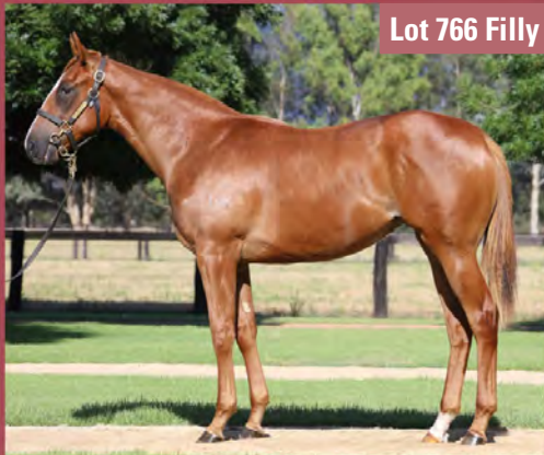
Lot 766 Filly

Snitzel x De Lightning Ridge, by Tale of the Cat (USA)