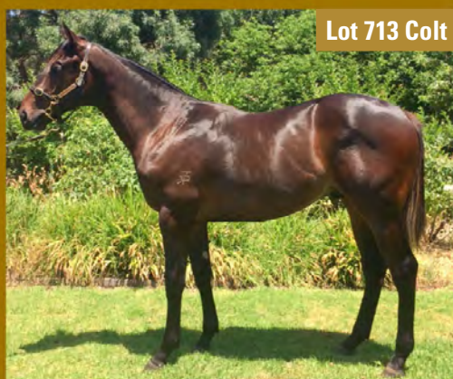
Lot 713 Colt