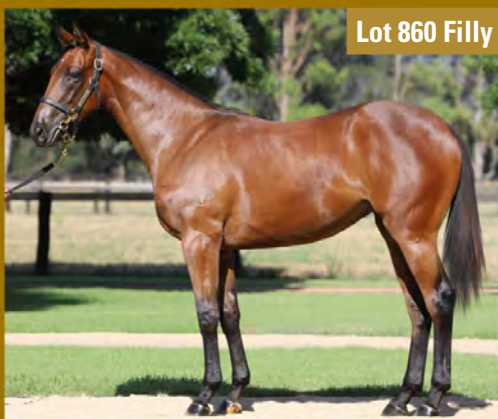
Lot 860 Filly