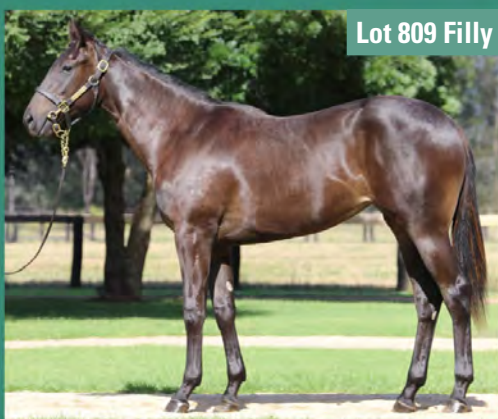
Lot 809 Filly