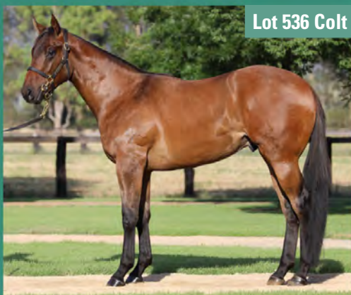
Lot 536 Colt

Second foal of an unraced sister to stakes-winner IL Warrrd and half-sister to stakes-winner Coy, from the family of Group I winner Zafeen.