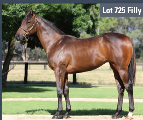
Lot 725 Filly