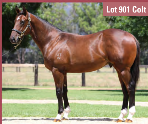
Lot 901 Colt

First foal of a half-sister to Group I WATC Winterbottom Stakes winner Takedown.