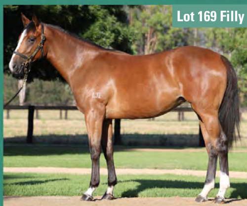
Lot 169 Filly

Half-sister to three winners from SW Lilakyn, a three-quarter sister to Group I winner Rock 'n Pop from dual Group I winner Popsy.