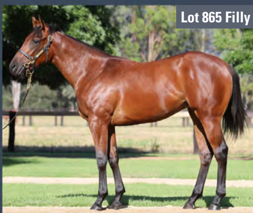
Lot 865 Filly