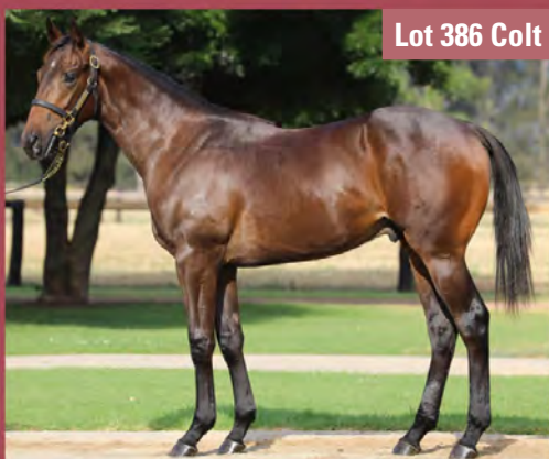
Lot 386 Colt