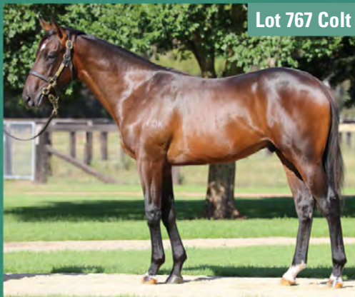
Lot 767 Colt

Your Song x De Sweet Soca Song, by Encosta de Lago