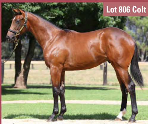
Lot 806 Colt