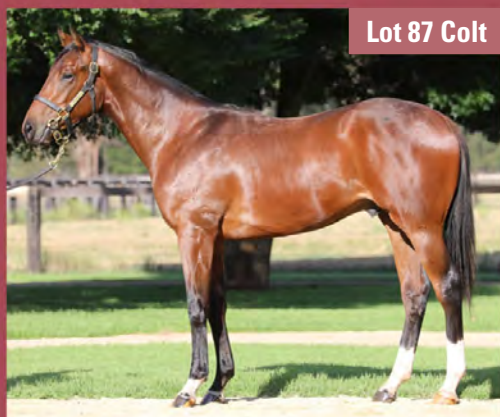
Lot 87 Colt

First foal of good Melbourne metro winner Hidden Message, a granddaughter of SW Queen of State.