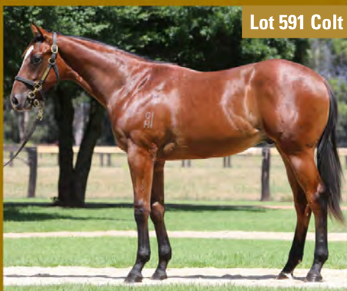
Lot 591 Colt

Half-brother to Group II winner Go the Knuckle and six other winners as well as the dam of Group I placed Denmagic.