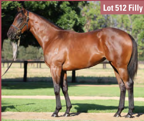
Lot 512 Filly

Half-sister to two winners from smart Flemington SW Tango Amigo's, a daughter of outstanding sire Danehill Dancer, the sire of over 170 SW's