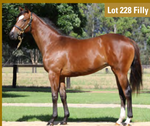
Lot 228 Filly

First foal of a placed daughter of Group I Curragh Moyglare Stud Stakes winner Mail the Desert.