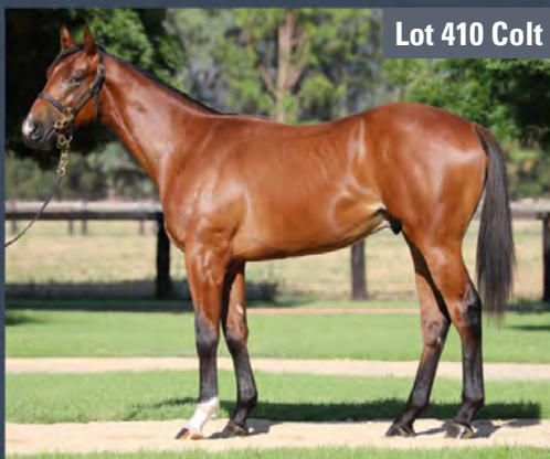
Lot 410 Colt