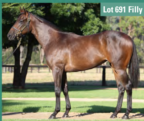
Lot 691 Filly