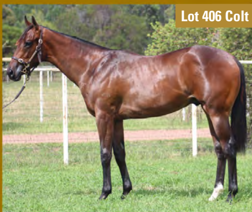
Lot 406 Colt