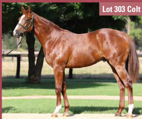
Lot 303 Colt

Second foal of an unraced half-sister to SW Mini Pearl from the family of Group I winner Pompeii Pearl.