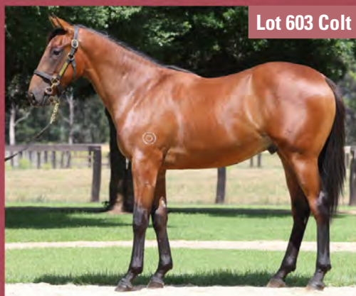
Lot 603 Colt