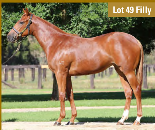
Lot 49 Filly

Half-sister to stakes-placed American Genius from smart metro winner Gibraltar Moon from the family of SW's Ain't Seen Nothin, Bahman, Stepitup and Ain'tnofallenstar.