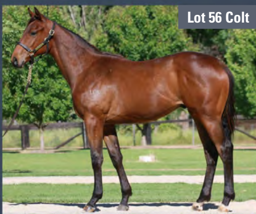
Lot 56 Colt

From a half-sister to SW's Dubawi Gold and Forest Gold from the family of Group I winner and MM 2YO Classic winner Driefontein, a winner of $2.3 million.