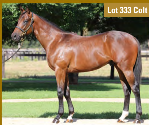
Lot 333 Colt

Half-brother to Group III winner Thurlow from SW Princess Emmy, joint winner of NZ Southern Filly of the Year.