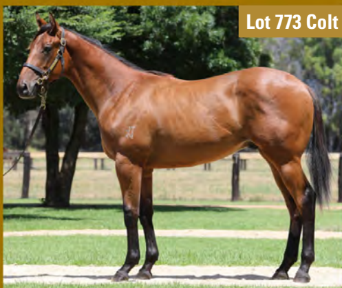
Lot 773 Colt

Star Witness x Dinkum Diamond, by Keep the Faith