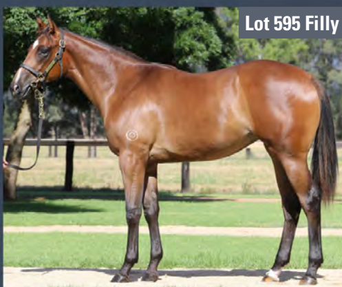
Lot 595 Filly

Half-sister to five winners from Group I Queensland Oaks runner-up Zumanity, a full sister to stakes-winner Crumpet O'Reilly.