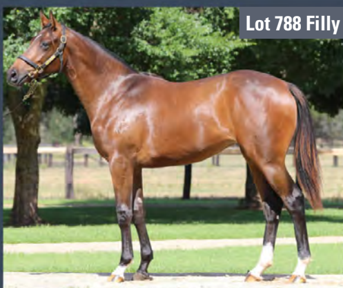
Lot 788 Filly

Zoustar x Dream 'n' Believe, by Shamardal (USA)