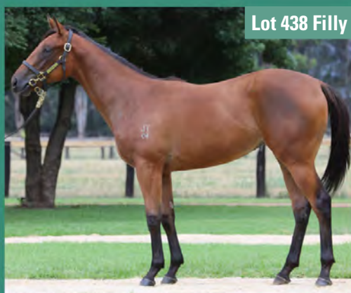
Lot 438 Filly