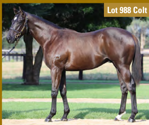
Lot 988 Colt

Half-brother to two winners from the family of juvenile stakes-winner Cruden Bay and Group II placed Lady Cay.