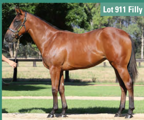
Lot 911 Filly

First foal of a winning half-sister to stakes-winner Pressing from the family of Group I winner Choice Bro.