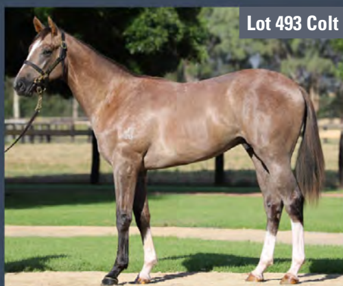
Lot 493 Colt