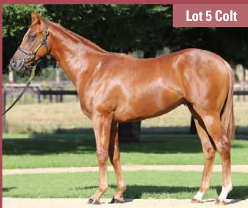
Lot 5 Colt

Half-brother to Group III winner Sharnee Rose, 4 wins and $567,450 inc. ATC Angst Stakes, Golden Pendant Stakes and to stakes-placed Zaffaan.