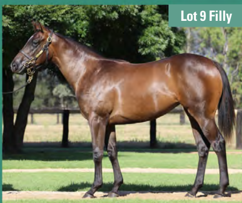
Lot 9 Filly

Third foal of stakes-placed Fast Talker, a daughter of stakes-winner Crystal Wit by champion sire Fastnet Rock.