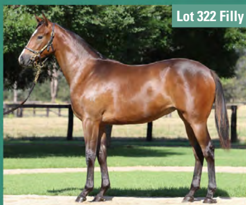
Lot 322 Filly

Half-sister to Group II winners Seaburge and Catch a Fire from a daughter of Group I SAJC Australasian Oaks winner La Volta.